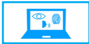
Biometric identity management as a service