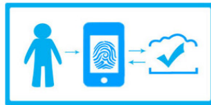
Integrated interactive messaging and biometric verification